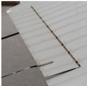
Elevator Trim Tab