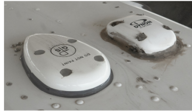
Dynon GPS Antenna