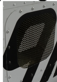
AC Vent (G1000)