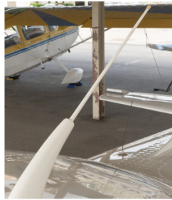
G1000 Com + GPS Antenna (Dynon Com Antenna only)