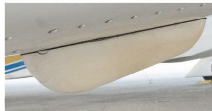
Marker Beacon Antenna