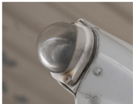
Tail Nav Light