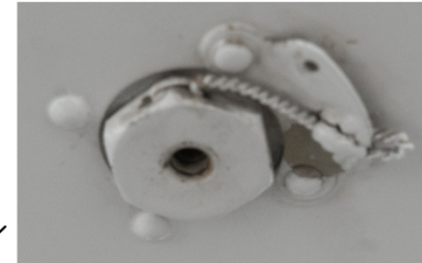
Fuel Sump (5 each wing)