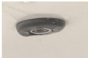
Fuel Sump (3)